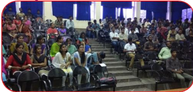
World Health Day (7-4-2023)