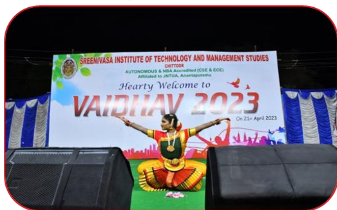
VAIBHAV-2023(Annual Day) (21-04-2023)