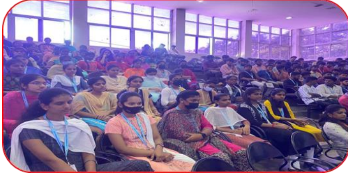
World Consumer Rights Day (15-03-2023)