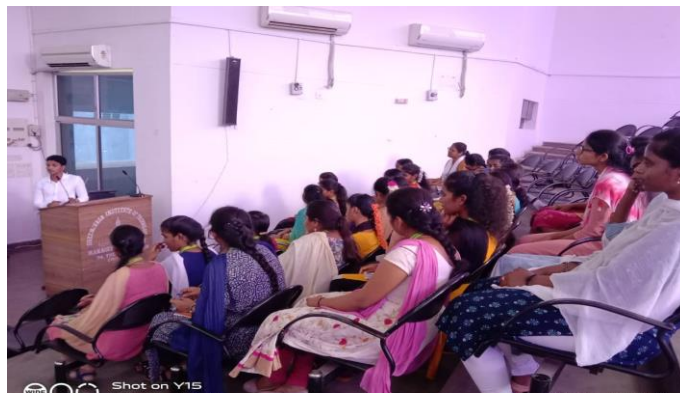
Guest Lecture on “ Job Opportunities and Interview Tips for Management Professionals ” on (03-03-2023)