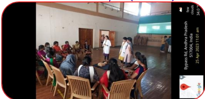
CPR Programme in association with Apollo Medical College (24-4-2023)