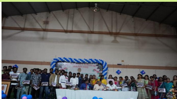
Farewell Day (12-06-2023)