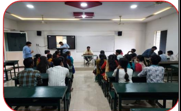
Central Excise Day (24-02-2023)