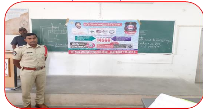
AP towards anti drugs (13-02-2023)