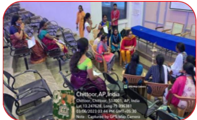
"STHREE- AN UN ENDING STRUGGLE" (07-03-2023)