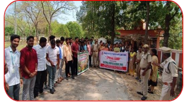
Special Camp (20-3-2023 TO 25-3-2023)