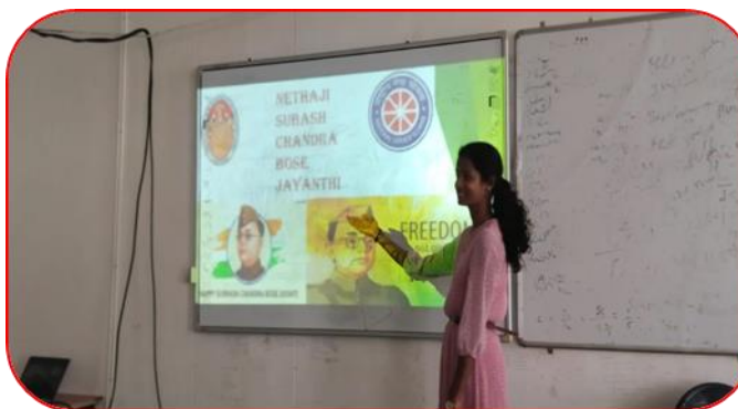
Netaji Subhas Chandra Bose Jayanti(23-1-2023)