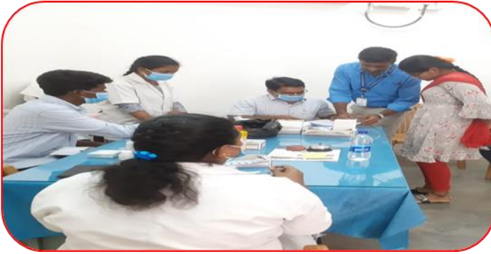
Blood Group Identification for first year students (30-01-2023)