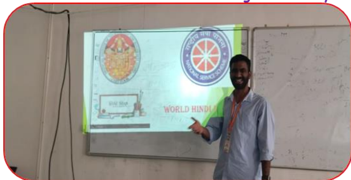
World Hindi Day (10-01-2023)

Our students as NSS Volunteers continuously showing leadership skills and serving rigorously for community health care, literacy drives, environmental protection, Blood donation camps, informative lecture on human values regularly to the society by visiting nearby villages and educating and helping the poor and the destitute. This time NSS has also organized many activities.