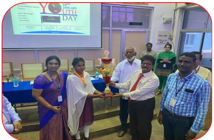
National youth day celebrations (12-01-2023)