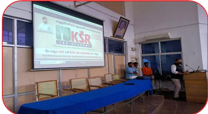
Awareness Program on "Dreaming IAS - The Path to Achieve it" (28-03-2023)