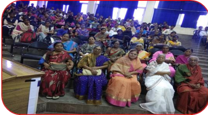
International Day of Women and Girls in Science (11-02-2023)