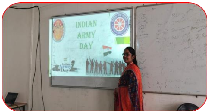
Indian army Day (19-1-2023)