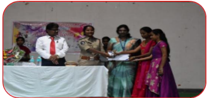
SANKRANTHI SAMBARALU-2023 (13-01-2023)