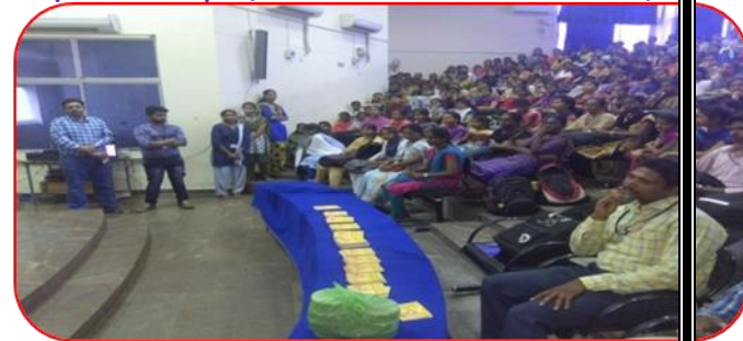
World Liver Day (19-4-2023)