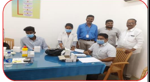
National Vaccination Day (16-03-2023)