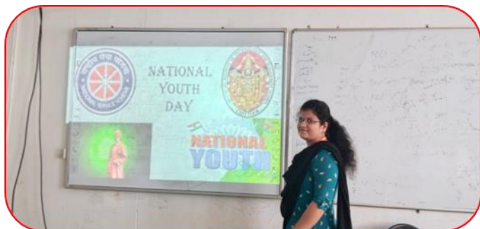
National Youth Day (12-01-2023)