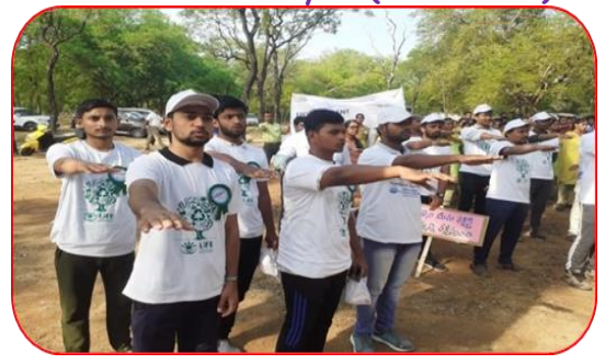
World Environmental Day (5-6-2023)