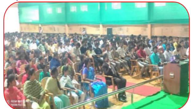
Guest Lecture on "Value of life, Motivational Speech on Life, Fear and Success" (03-02-2023)