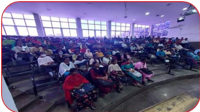
International Mother Language Day (21-02-2023)