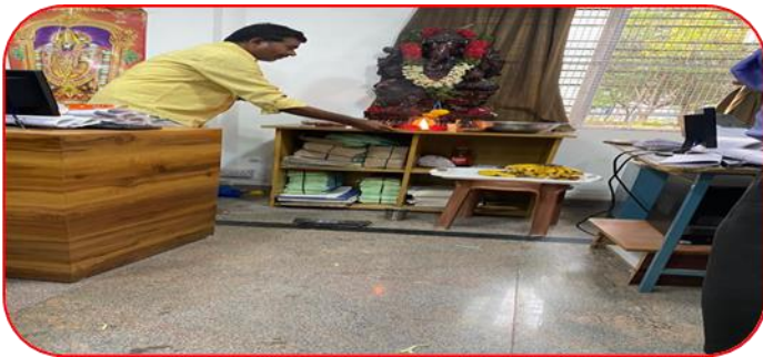
Ugadi Festival Celebrations (22-3-2023)