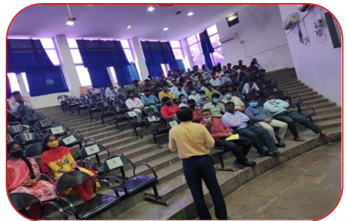
2nd International Conference on Advances and Innovation in Engineering and Sciences(ICAIES-2023) (12-04-2023 & 13-04-2023)