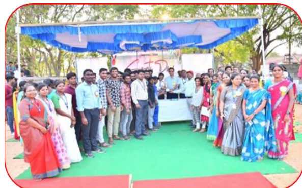
Sports day (20-04-2023)