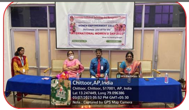
International Women's Day (08-03-2023)